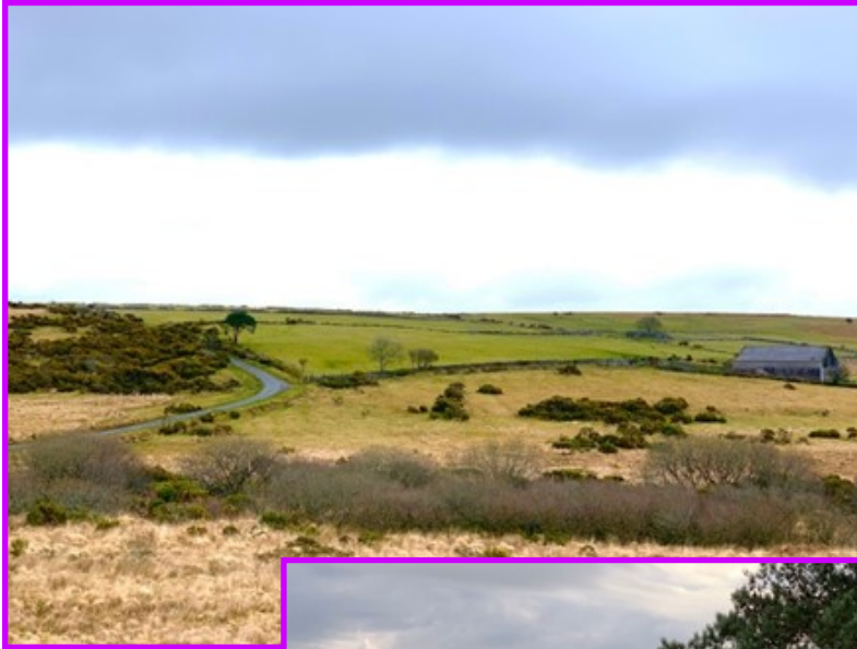
Site of the proposed music festival at Colliford. Report (p8) and pictures courtesy of Thomas Thrussell