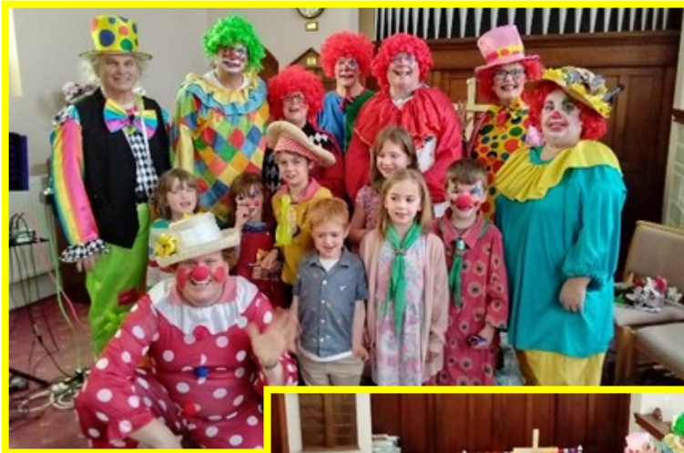
St Neot Chapel Easter Sunday Clown Service with face painting, balloon animals and, of course, chocolate! All ably supported by St Neot Beavers